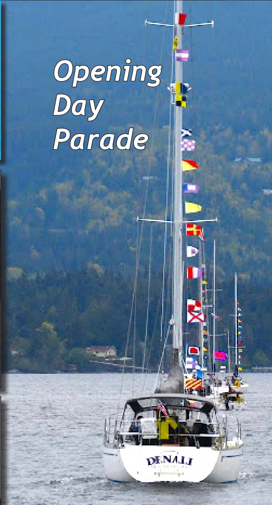
Top left: Vice commodore Sue Baden and Carmi Standish salute as members pass the Flora Mae as the boat parade concludes.